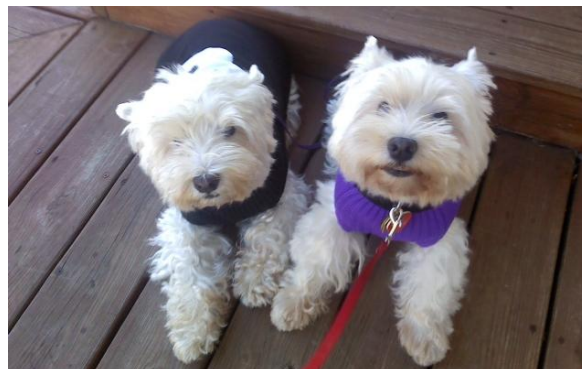
Blossom and Wrigley