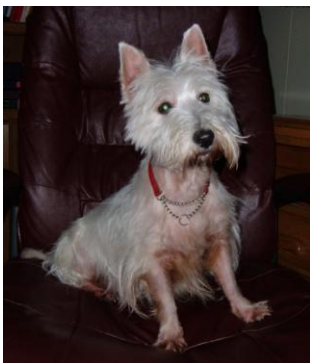
When she came in

Note: Dogs that have ear infections will require ear drops such as Mometamax or Baytril. Medication is selected based on what is seen on the ear canal testing.