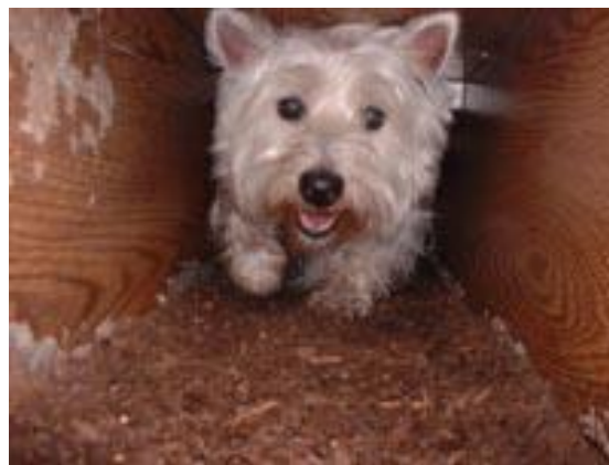
Underground-heading to the rat