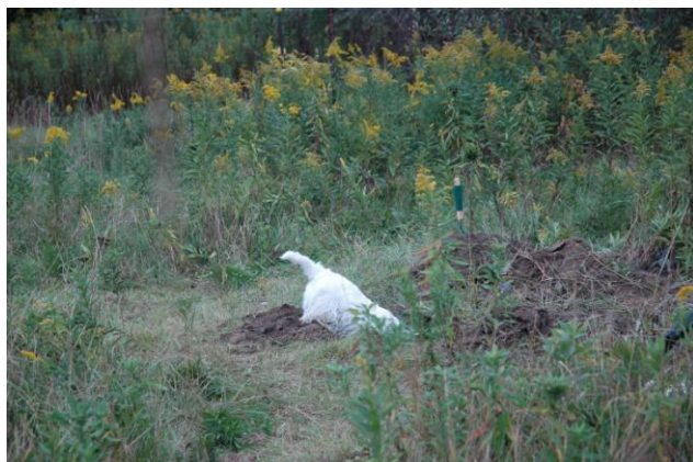
Entering the Earth