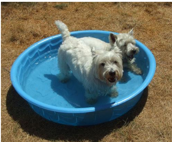
ROCKET AND FRANKIE