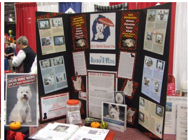
Rescue Display Board