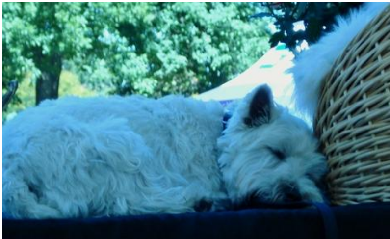
Rocket worked hard and earned a rest at the Grand Rapids Event