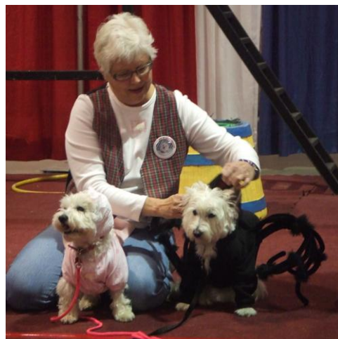
Miss Muffet and the Spider